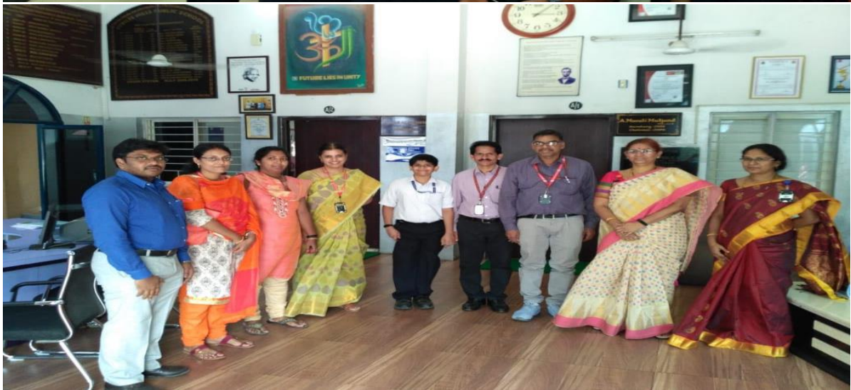
GRIET Team with Students and School Teachers