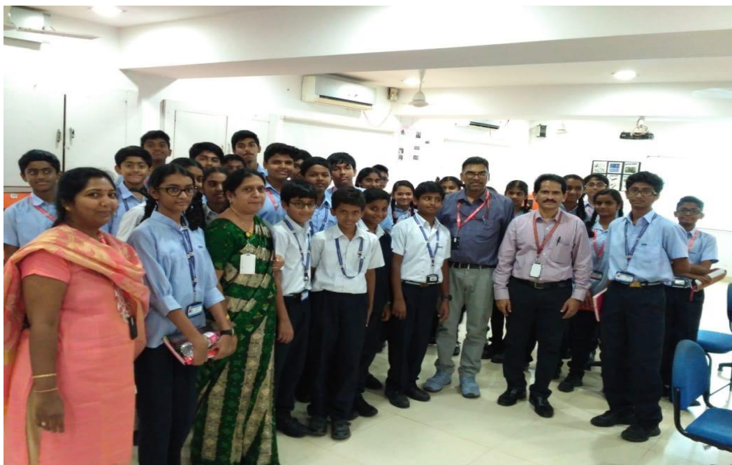
GRIET Team with Students of JHPS Sept1,2018