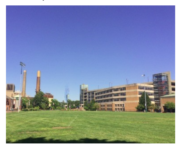
Fig 1.4 Forged image