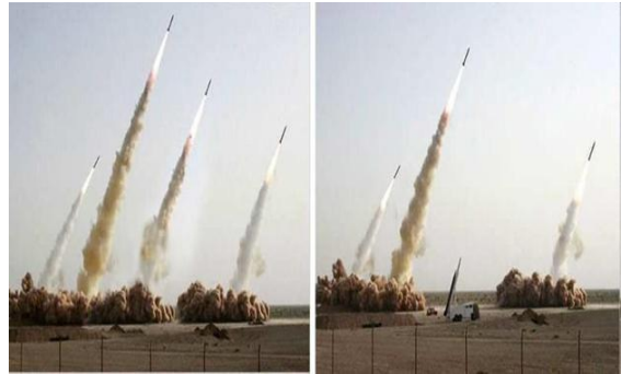
Figure 5. Re-tested picture: Iran armed force's Missile

to overemphasize their military durability by just uncovering 4 shot rather than 3 in the underlying picture.