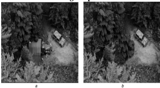
b Forged picture 1