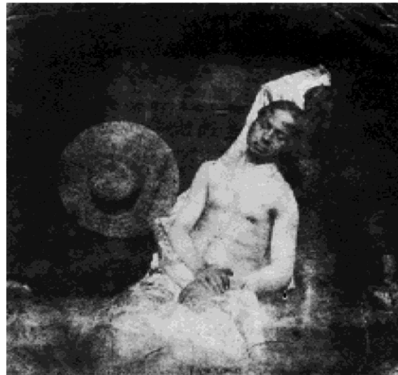
Fig. 1 : First phony picture

Picture fraud can be mapped back to as in all respects right on time as the 1840s when Hippolyte Bayard created the amazingly first fake picture, in which he was uncovered devoting an implosion. In 1860s an extra fake picture appeared in which the head of Abraham Lincoln (the after that United States Head Of State) was fixed over the body of a resistance political pioneer, Numerous different conditions may be situated out of sight of the length stretching out over the late nineteenth century and furthermore the in all respects mid twentieth century. With the entry of the Hollywood variable, development films with incorporated scenes have really wound up being a standard. Distinctive altered fight photographs after that appeared and furthermore utilizing such pictures was pondered part compelling fight exposure,