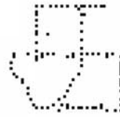
Fig. 2 Segmented polygon of the Tamil character 'KA'

Step 2: A mask of 3 consecutive one's, {111}, is placed over the substring of the primitive string and a dot product is applied to generate one puzzle piece.