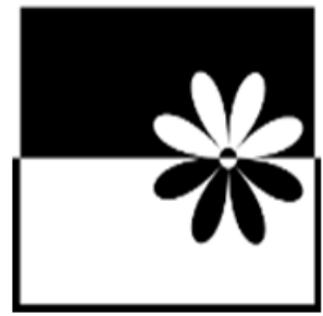
Figure 5. Logo image