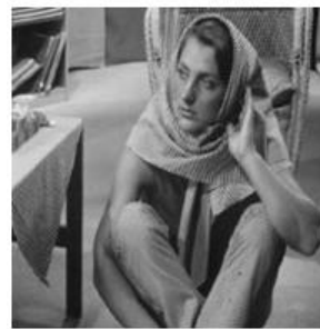
Figure 4. Host image