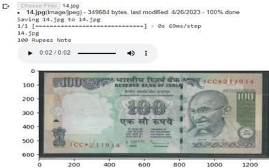
Figure 2. Indian Currency predicted with voice message

Indian currency classification is a crucial task for ensuring the safety transaction of money, and the use of deep learning techniques like CNN models can provide accurate and efficient solutions. Figure 2 gives the output results for the data where each currency note is identified properly and accurately with voice message.