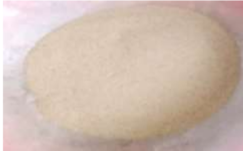
Fig 3. Sand

The sand utilised for the experiment was clean sand that had been passed through a 425 micron sieve, as indicated in Figure 2, and had been oven dried for 24 hours to remove moisture before the tests were conducted.