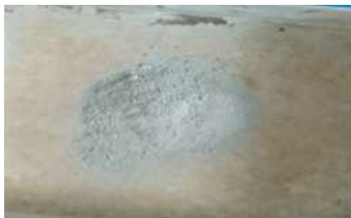
Fig 4. Cement

The Portland pozzolanic cement (PPC) utilised in the study was acquired from the market and has a specific gravity of 3.14.