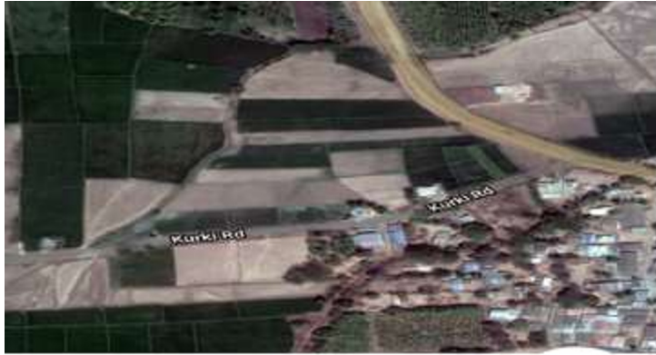
Fig 1. The topological view of study area

The soil was air dried and pulverised to pass through an IS425 micron sieve, then oven dried at 1100C before testing for various engineering properties