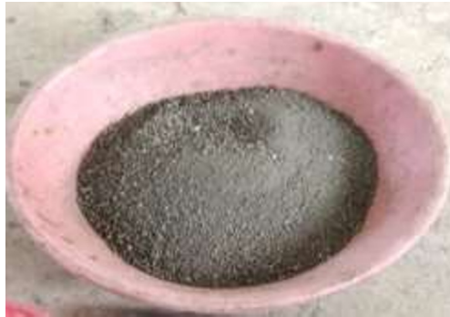
Fig 2. Black cotton soil

The soil was air dried and pulverised to pass through an IS425 micron sieve, then oven dried at 1100C before testing for various engineering properties